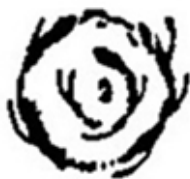
Bullseye or Halfmoon (partial Bullseye)

Examples of often-repaired windshield damage are: